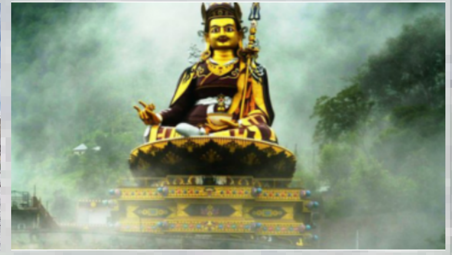
Rewalsar Monastary/ Lake/ Gurudwara/ Temple