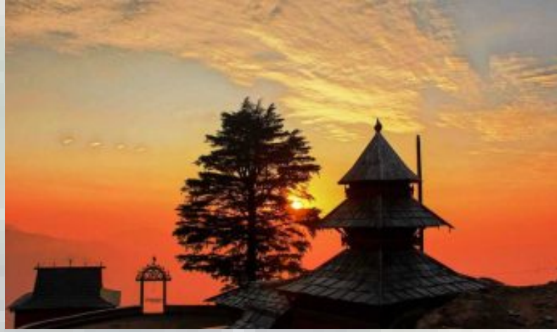
Aadi Purkha Temple