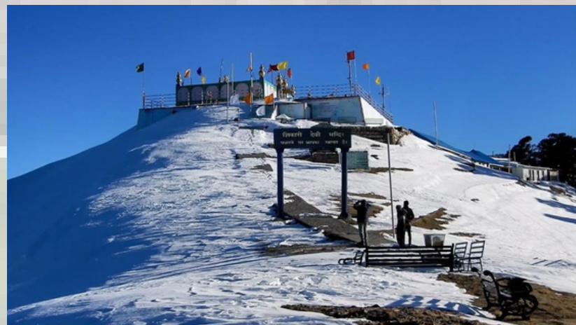
Shikari Devi Temple