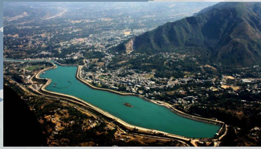
View of Lake at Sundernagar